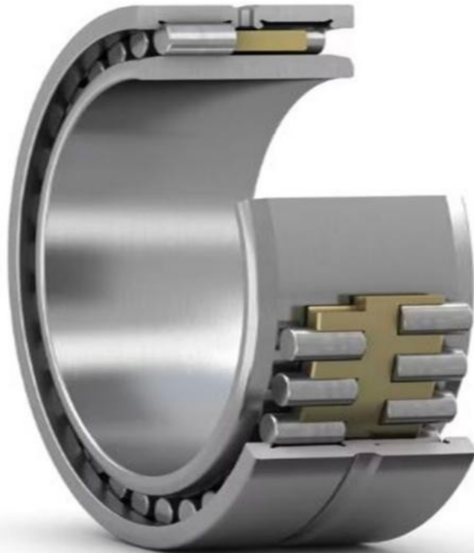
Cylindrical Roller Radial Bearings/Two-Row

In conclusion, experimental validation through laboratory testing, case studies demonstrating improved durability, and comparative analysis with traditional bearing configurations collectively underscore the importance of optimizing load distribution in two-row cylindrical roller radial bearings. These insights inform engineering practices and drive continuous innovation in bearing design, ultimately enhancing durability and performance across diverse industrial applications.