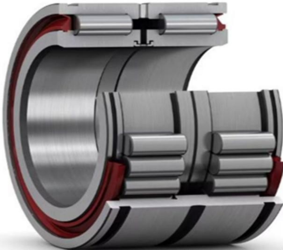
Cylindrical Roller Radial Bearings/Two-Row

In summary, the geometry and design of bearings, operating conditions, and lubrication mechanisms are critical factors influencing load distribution in two-row cylindrical roller radial bearings. By comprehensively understanding and addressing these factors, engineers can effectively optimize load distribution for enhanced durability and performance in various industrial applications.