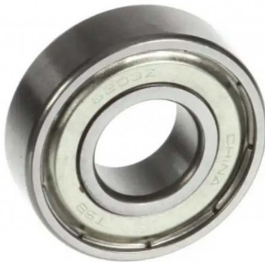
nsk 6203z bearing

This table provides a quick overview of some key specifications for NSK 6203z, SKF 6203, and FAG 6203 bearings. Keep in mind that actual specifications may vary, and it's always advisable to refer to the specific datasheets or documentation provided by each brand for precise details.